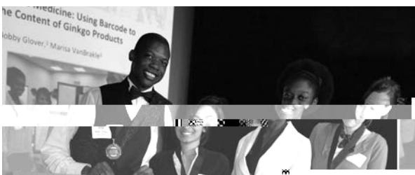
Urban Barcode Project grand prize winners